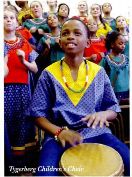
Tygerberg Children's Choir

pulsating, interactive music-theatre show that recreates the vibrant township street life. The restaurant-theatre is managed by the SU Woordfees and is open for dinner daily but the shows are only on Fridays. Book via Computicket or send an email to bookings@amazinklive.co.za.