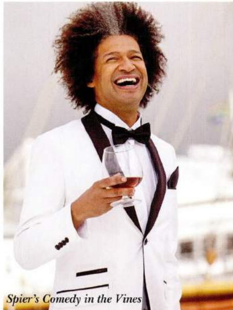
Spier's Comedy in the Vines